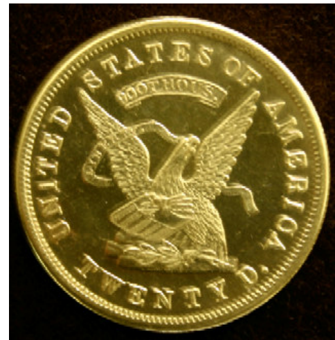
United States Assay Office $20 Proof from the Franklin Hoard in the Bank of California collection.

Please note that our annual Holiday Potluck will be held at Ft Mason, Building C on Wednesday December 16. It is a lot of fun and is delicious! Be there!