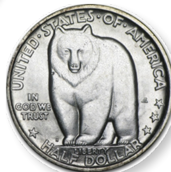
Bear on 1936 Bay Bridge Commemorative