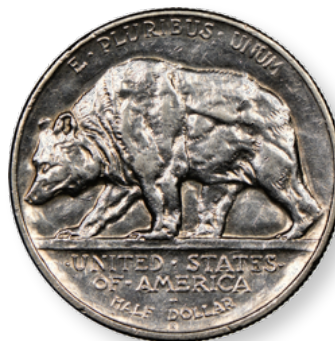
Grizzly on the 1925 California Diamond Jubilee Commemorative

Ed T showed three very interesting 80mm Portuguese medals with lighthouses.