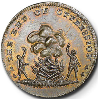
Conder Token Attributed to Thomas Spence

Those of us who were raised in the U.S. public school system probably never gave a second thought to how Native American society might have influenced the philosophy of European settlers. Interestingly, some of the features of indigenous society are quite similar to the treatises of Thomas Paine ( The Rights of Man , 1792) and Thomas Spence ( The Rights of Infants , 1797).